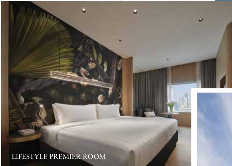
LIFESTYLE PREMIER ROOM

With 527 rooms and suites featuring lush greenery and sustainable amenities, and a dedicated wellness floor, feel a sense of rejuvenation and invigoration when stepping into our spaces.